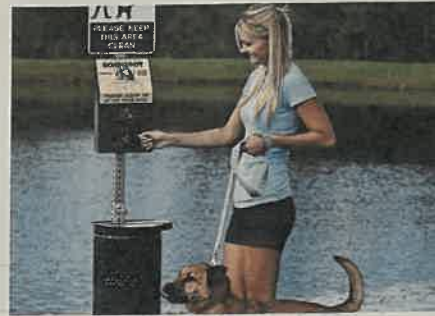
WASTE BAG DISPENSER