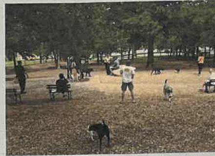
WOOD FIBER SURFACING