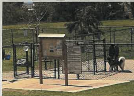
BULLETIN BOARD & SIGNAGE