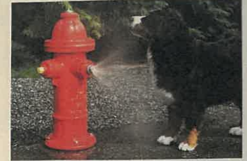
WATER COOLING & PLAY