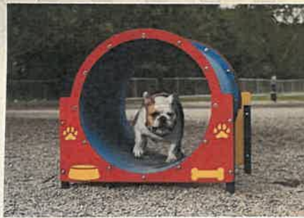
DOG AGILITY FEATURES