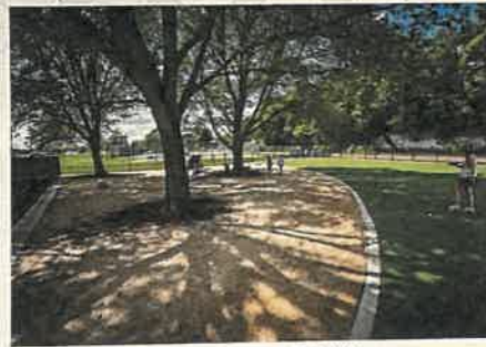
PLANT SHADE TREES