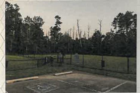
PARKING LOT AREA